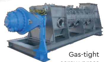
Gas-tight screw press in conical design