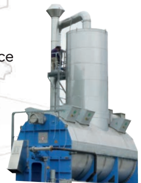
VetterTec tube bundle dryer with bag filter in ATEX/NFPA design